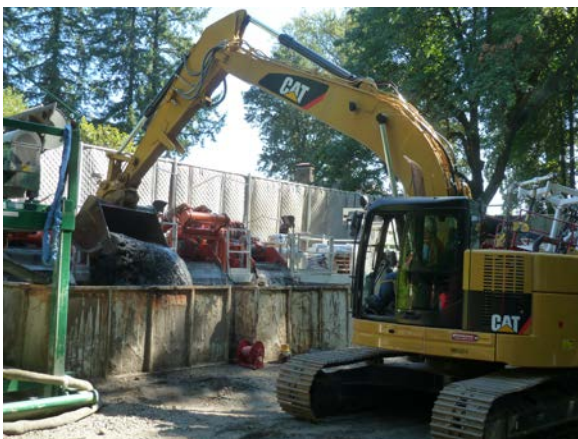
Separating solids and drilling fluid at the solids separation tank at the HDD site