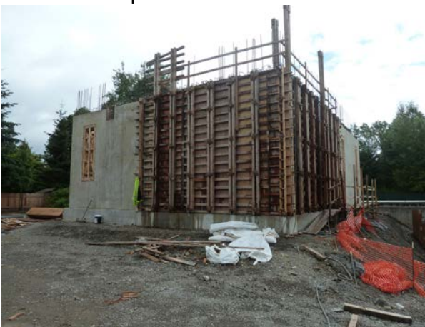
Forming walls for the Mechanical Dewatering building.