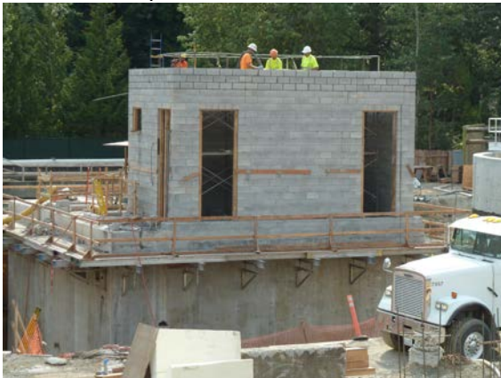
Above: Crews working on the solids storage tank at the WTP Below: Installing drill pipe for the pilot hole at the HDD site