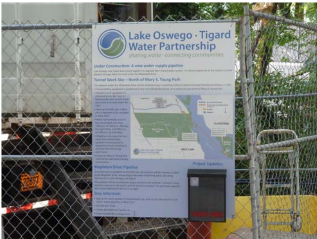
Signage and information kiosk installed at the HDD site