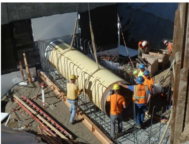
Crews installing 54" pipe to connect the new clearwell and filters