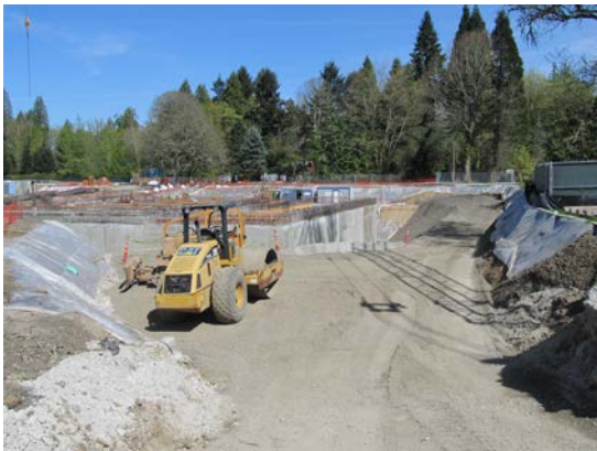
Vibratory rolling compactor compressing fill south of clearwell