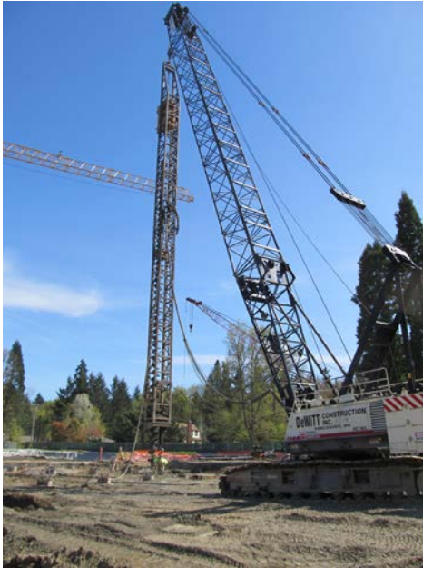
Drilling auger cast piles for the electrical building