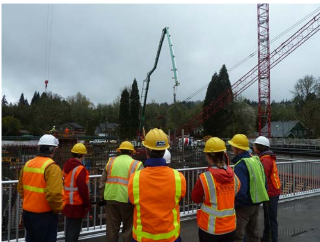
Tour attendees viewing a concrete pour in the ballasted flocc.