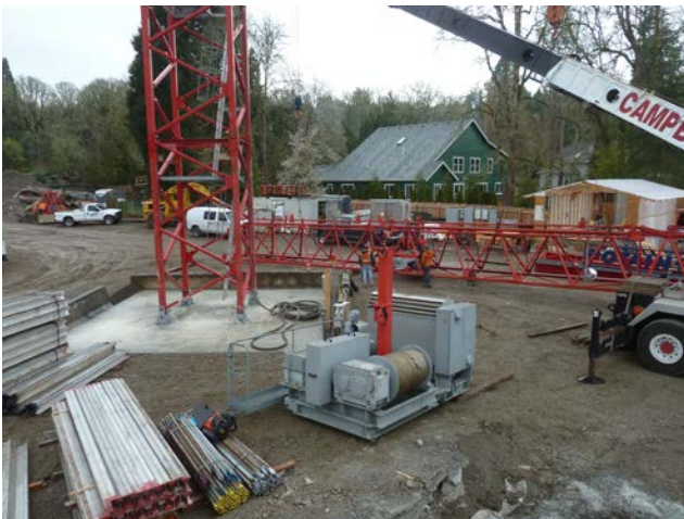
Assembling the second tower crane last week