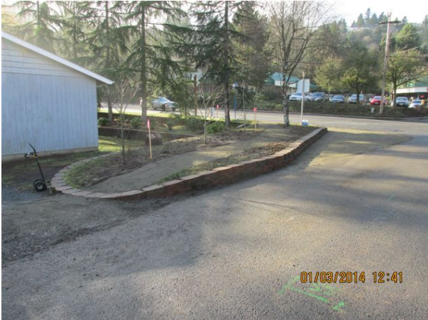
Preparing for demolition of the lime building (below)