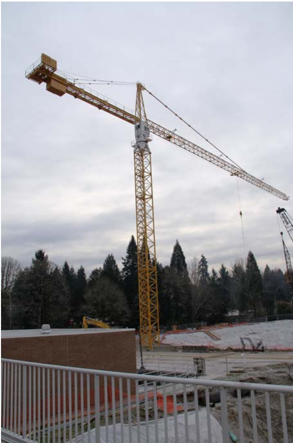
150 foot tower crane assembled and operating on-site