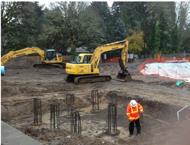
Piles drilled for foundation of tower crane