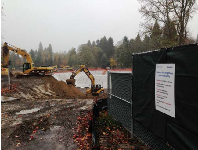
Preparing the clearwell access ramp for auger cast pile crane