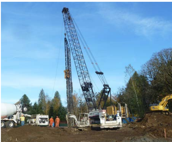
Auger cast pile drilling for overflow piping for lagoons.