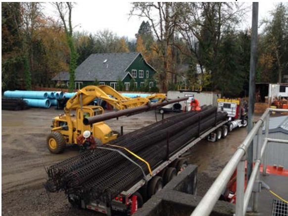
Steel cage reinforcing for deep piles arrives at the WTP site.