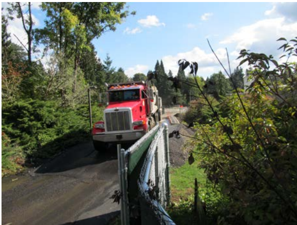
A dump truck using the wheel wash before exiting the site on Thursday 9/26/13