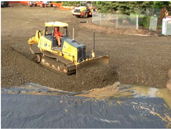
Leveling ground for onsite office trailers on Wednesday 9/25/13

http://www.lotigardwater.org/?p=work-underway