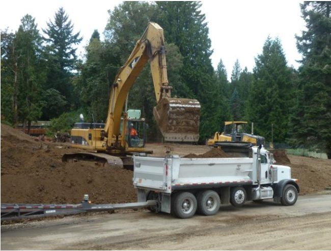
An excavator loading soil into haul trucks on Tuesday 9/17/13

http://www.lotigardwater.org/?p=work-underway