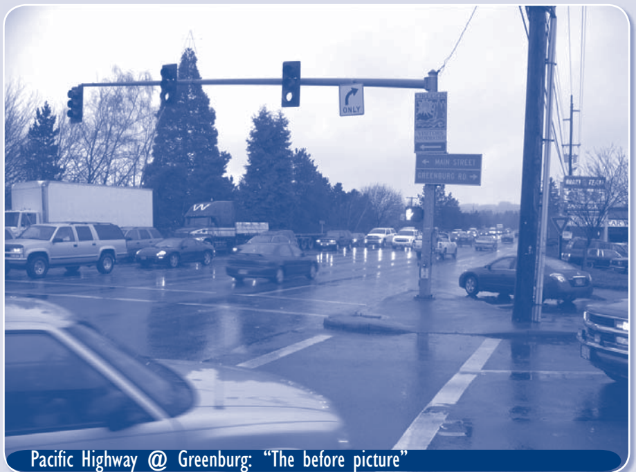
Pacific Highway @ Greenburg: "The before picture"